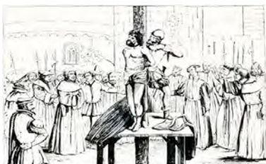
1536 Tyndale Strangled and Burned

William Tyndale was born in England in 1492. He wanted the common man to have the Bible in his own language. Tyndale was imprisoned for over a year before being choked to death and burned.